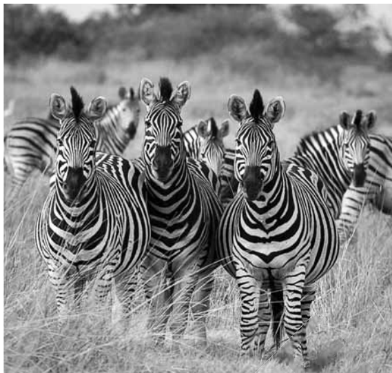
Figure 18.5 Vertebrates.

Vertebrates like zebras and humans have blood that both forms clots and makes fibers. But the chemicals that make the fibers in our blood clots are completely different from the chemicals that do this in horseshoe crabs.