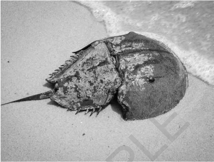
Figure 18.4 Horseshoe crab.

multimillion-dollar industry has been developed based on using horseshoe crab clotting proteins to test for bacterial contamination in injectable and intravenous drugs used by humans.