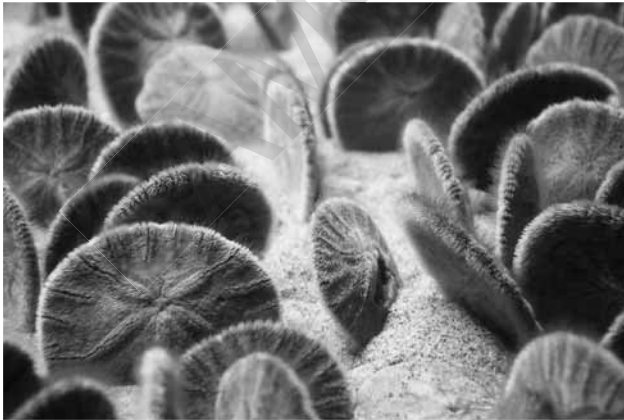
Figure 18.2 Sand dollars.

In slightly more complex organisms, a plug, or clot, is also formed. There are many different levels of complexity for these clots. For instance, in sand dollars and many of their relatives, the blood cells simply clump together on a temporary basis to form the plug, or clot.