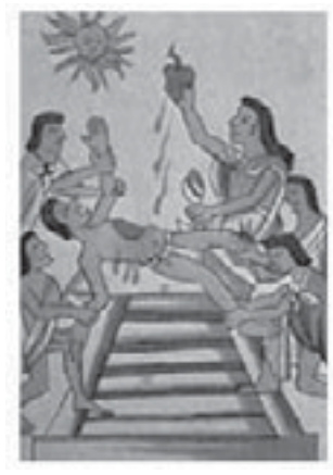
Aztec sacrifice to Huitzilopochtli

The list of divine names given in Column 1 – some familiar, some not – could be extended quite easily by many hundreds of additions. There is one feature of it, however, that stands out. For the most part – there are admittedly one or two exceptions – these are all the names of gods who are dead, by which I mean that no one believes in them anymore. Yet once upon a time these immortal beings were worshipped by thousands, if not millions of believers: sacrifices were made to them, prayers were offered up to them, songs sung in praise of them, priests ministered to them in elaborate rituals, wars were fought in their name; and not to believe in them, or even merely to doubt their existence, was an offence invariably punished