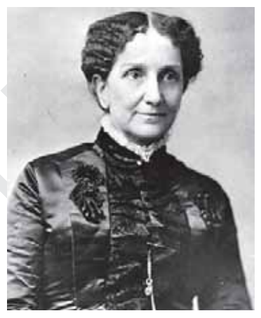
Mary Bakker Eddy

Any theistic attempt to resolve the alleged incompatibility between the existence of God and the existence of evil is called, following Leibniz, a theodicy (from the Greek, theos [God] + dike [justice] and down the centuries many classic theodicies have been offered. Some may be discarded from the outset. The first two of these resolve the problem of evil by evading it altogether, that is, by the simple expedient of denying one of its components: i.e., that no evil exists or that no omnipotent God exists. The first alternative is found, for example, in the teachings of Christian Science. The founder of the movement, Mary Baker Eddy (1821-1910) maintained that disease