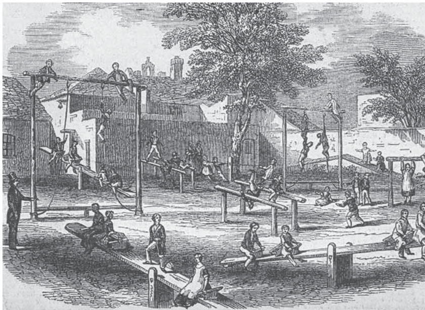
The children's playground at the Home and Colonial Training College.

and one kitchen maid. The junior chaplain lived next door at 18 St Chad's Row. 33 Women students were usually expected to undertake strenuous domestic chores to prepare them to run a schoolhouse and instruct future pupils in housecraft. With cooks and maids in residence at St Chad's Row, Ho and Co women doubtless had more time for study, exercise and rest than students at smaller colleges.