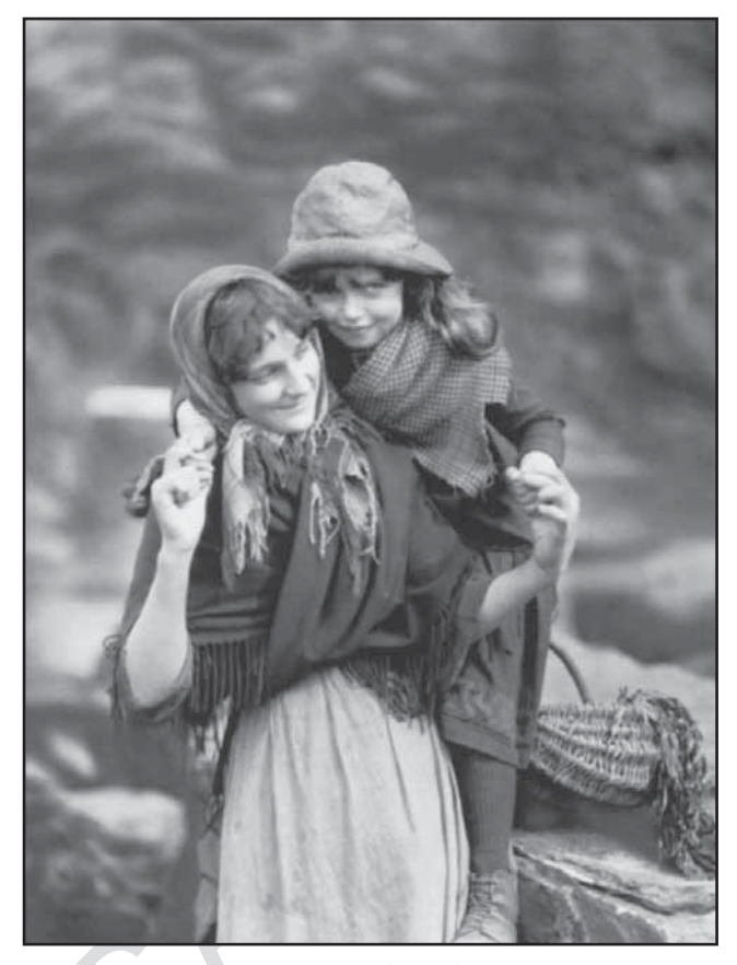
A Whitby fishwife.

industry is male dominated and the role of the womenfolk within that culture is perhaps most underrated This is usually by omission in that most books about the fishing industry tend to concentrate on men and boats. Indeed, until recently many memorial statues only featured fishermen – although this seems to be being rectified in some communities where women have been portrayed in various roles (for example, at Fleetwood a mother and her two children are looking out for the returning fishing vessels, at Bridlington a girl is knitting a gansey, and at Stornoway a herring girl is portrayed).