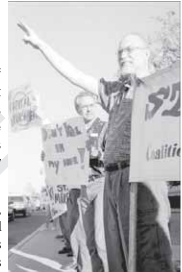
Protest against capital

As we shall see, this difference between the teleologist and the deontologist is the most fundamental one in normative ethics. Simply put, the former looks ahead to the consequences of his or her actions, while the latter looks back to the nature of the act itself. It is not, however, always easy to pigeonhole our everyday decisions in this way, and invariably we find that they are compounded of both teleological and deontological elements.