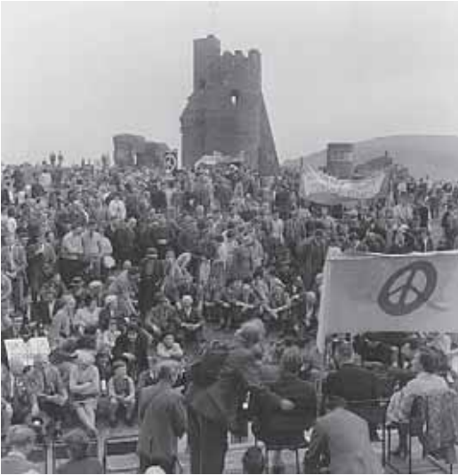
CND protest against nuclear weapons

preoccupation with the analysis of language, this branch of ethics has tended to dominate ethical discussion. It is held that one cannot even begin normative ethics without a prior analysis of the terms it uses. Certainly the overlap between the two is extensive, although whether meta-ethics is necessarily prior to normative ethics is an open question and the subject of considerable philosophical dispute.