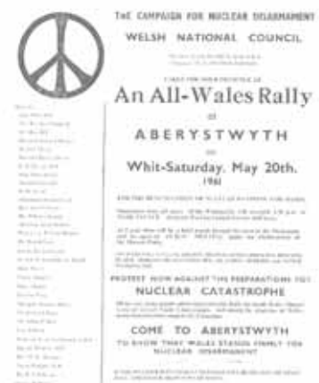
CND poster against nuclear weapons

In recent years, largely through philosophy’s increasing